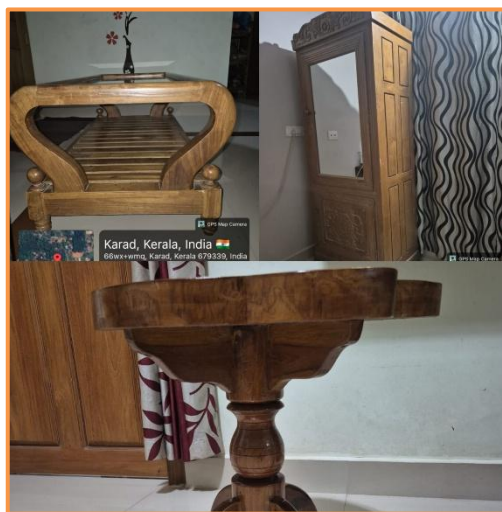
Fig 3: Furniture made using Nilambur Teak