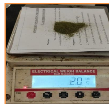
Neem Leaf Extract Powder