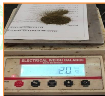
Notchi Leaf Extract Powder

Notchi contains bioactive compounds like flavonoids, terpenoids, and phenolic acids, which contribute to its insecticidal and repellent properties (Kumar et al. , 2018). Studies have shown that Notchi extracts and powders can effectively repel storage pests like rice weevils and grain borers (Senthil Nathan et al. , 2008). Reduce pest infestation and damage to stored grains (Raja et al. , 2015). It also protects grains from fungal growth and mycotoxin contamination. Rajeswari and srinivasan, 2019 reported that Leaf powder of notchi ( Vitexnegundo ) caused about 90% mortality of rice weevil ( Sitophilus oryzae ) and arrested further multiplication, improving seed storability. Neem contains bioactive compounds like azadirachtin, nimbin, and nimbidin, which contribute to its insecticidal and repellent properties (Kumar et al. , 2018). Neem's bioactive compounds can disrupt insect development and reproduction, leading to population decline (Mordue & Blackwell, 1993) and disrupt insect feeding behavior. Leaf powder of A. indica achieved 100% mortality at concentrations \geq 25 mg within 14 days, indicating strong entomocidal activity against Sitophilus oryzae