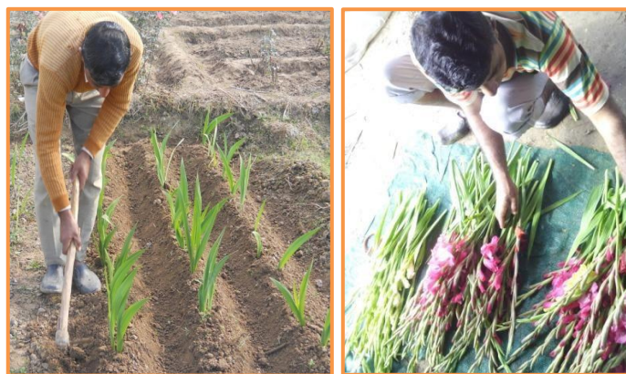
Earthing up and Grading

Harvesting is carried out at tight bud stage with at least four leaves left on the plant intact, and at least one to five buds showing color. Spikes should be cut in morning or evening hours when the temperature is mild. Spikes are cut with sharp edged secateurs or knife. Care should be taken not to crush the stem. Cut spikes should be kept in a vertical position to prevent geotropic bending.