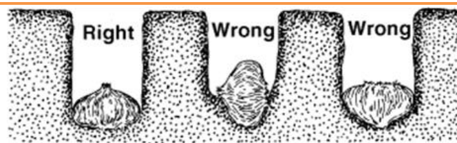
Plant corms with pointed side upright