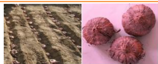
Gladiolus corm planting in furrows

Spacing: Plant to Plant: 20 cm; Row to Row: 40 cm. 50, 000 corms are required for planting in one acre area.